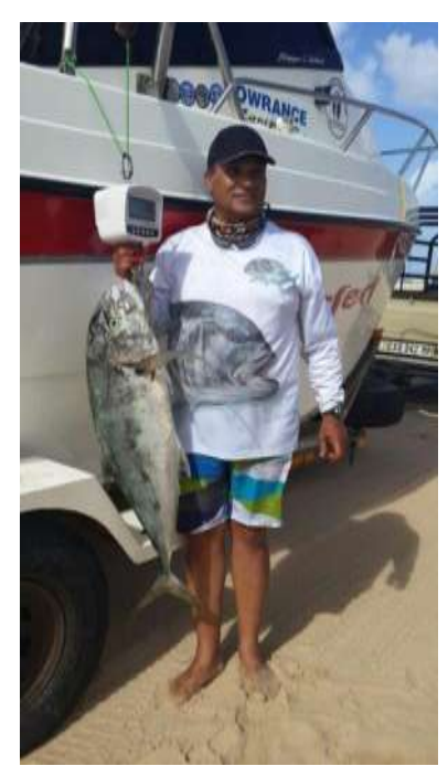
Yellow Spotted King 9.8 Kg