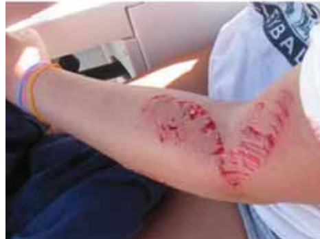
BARRACUDA HY BYT SEER!!!