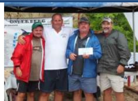
Third place – Charlie's Angel