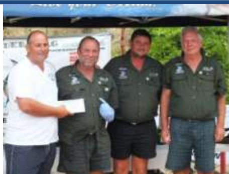
Second place - Fatikaki