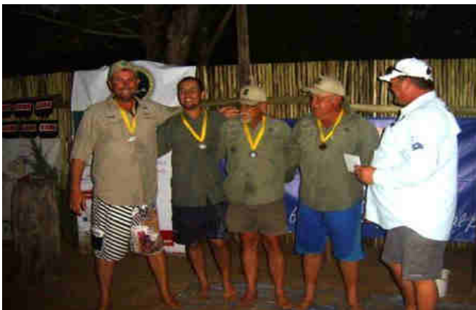
3rd Place Boat, Solid Cat