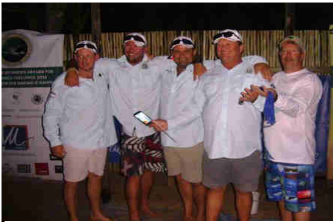
2nd Place Boat, Suzi Q