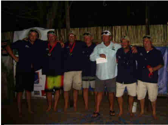
1st Place Boat, Gone Overboard