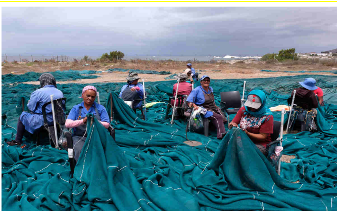
Women from Steenberg's Cove and nearby towns fix trawling nets at Alnet, in the Sandy Point Harbour, a few kilometres from Steenberg's Cove.

To mitigate the effects of the crisis, the Department of Environment, Forestry and Fisheries then decided to extend the harvesting season for an additional three months. Yet, it remains unclear whether prices will bounce back and whether fishermen will be able to recover their lost income.